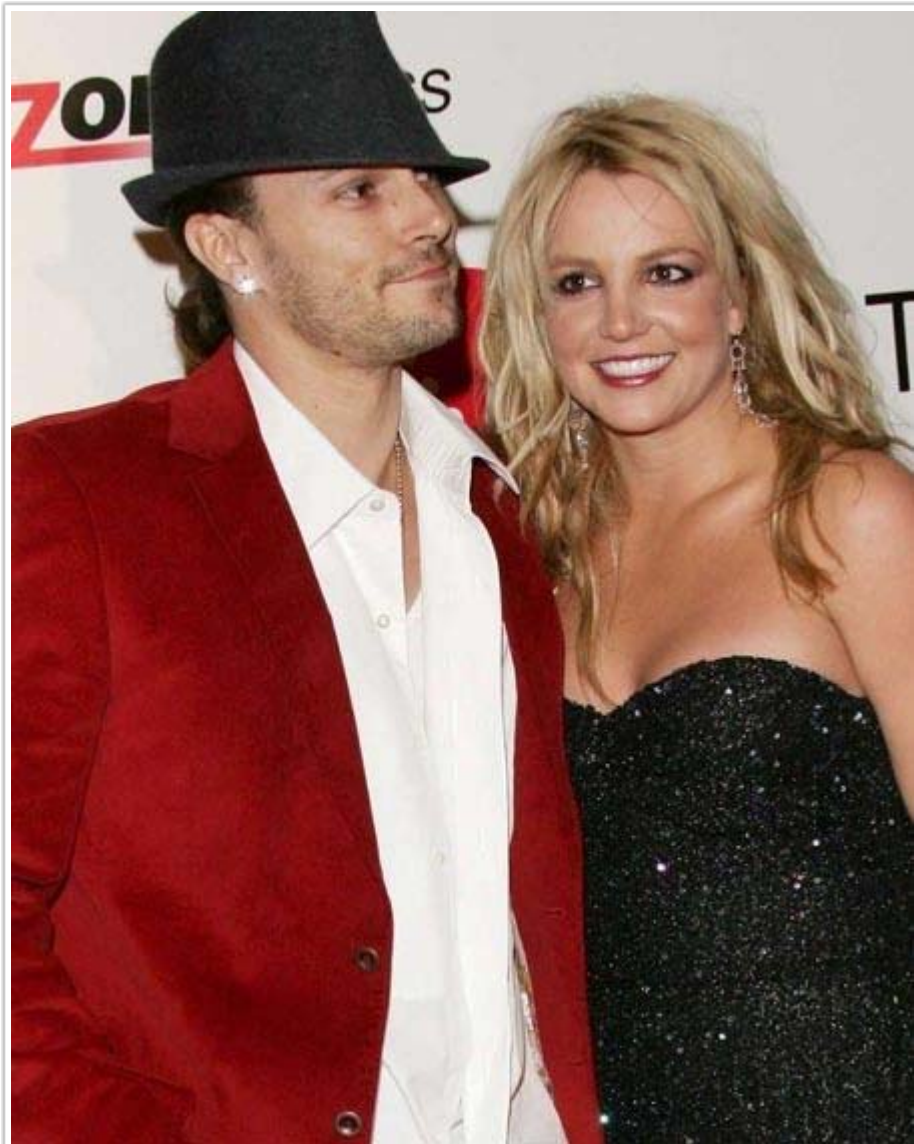
Above: New start? Britney and Kevin spent a weekend together